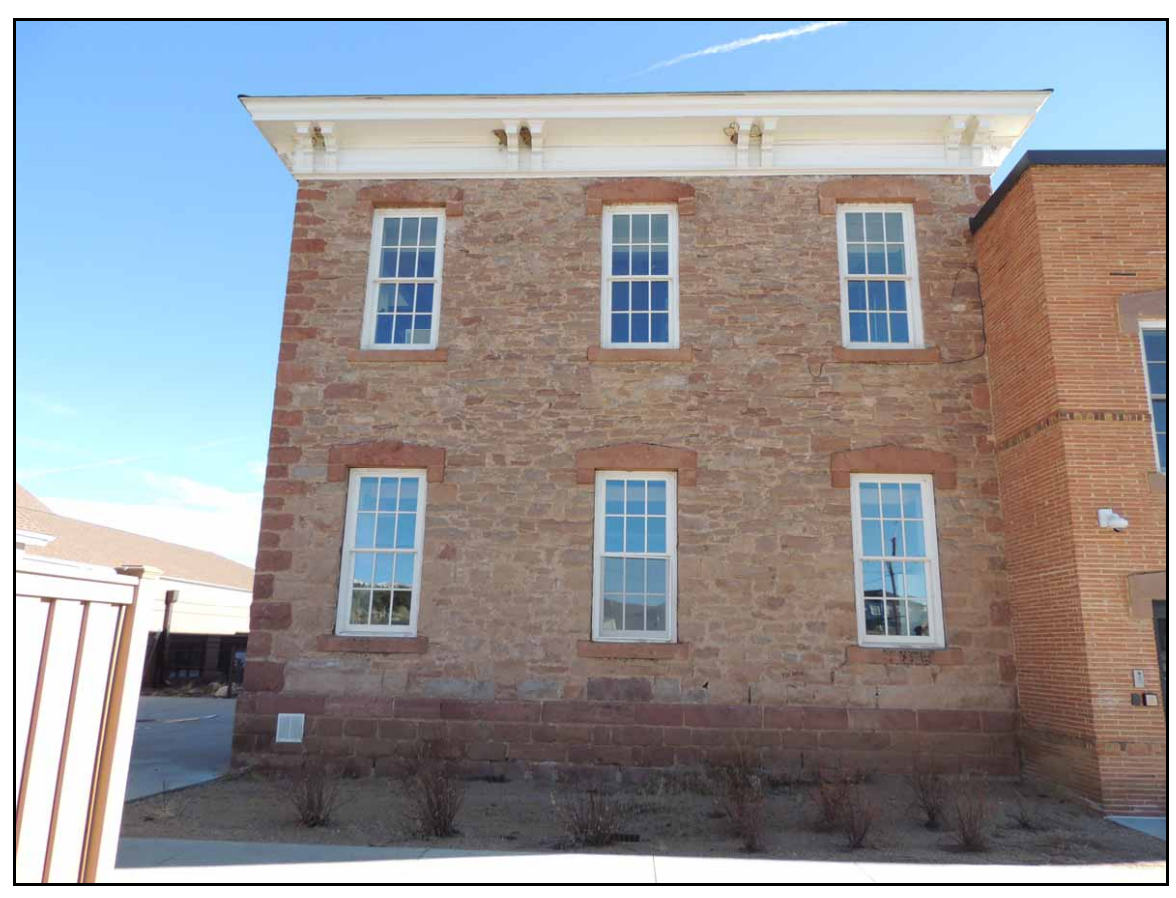
This is the original stone school building in Alma, Colorado which was built in 1880.