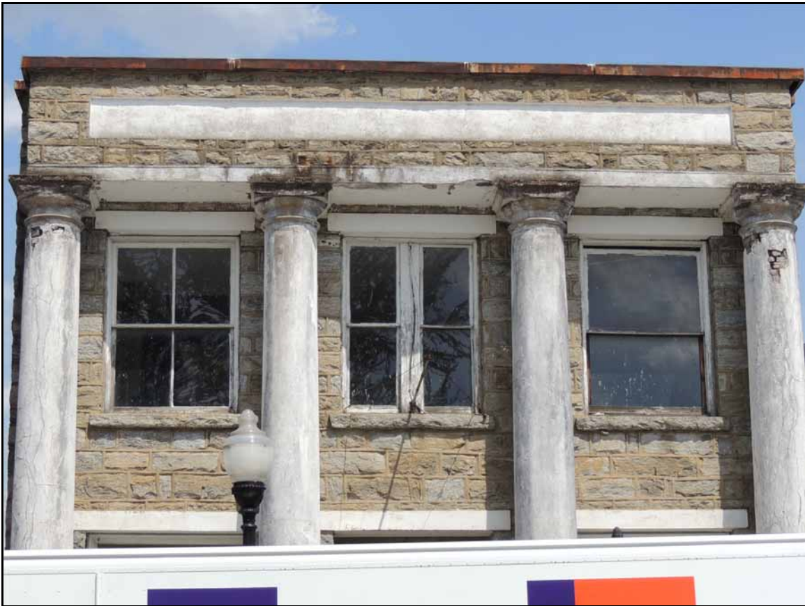
The two center columns look like solid stone, but the two outer columns, especially the one on the right tell a very different story.