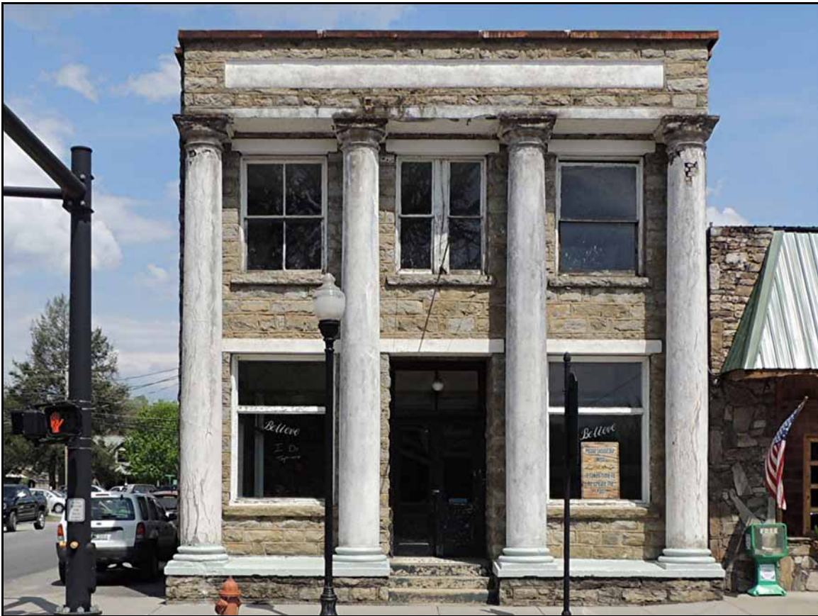
This building was the Bryson City, North Carolina bank. It is a stone building much in need of a cleaning and renovation. The front of the building faces west so it gets a lot of sun which helps keep the face of the stone clean. Note the mold and grime on the undersides of the tops of the columns.