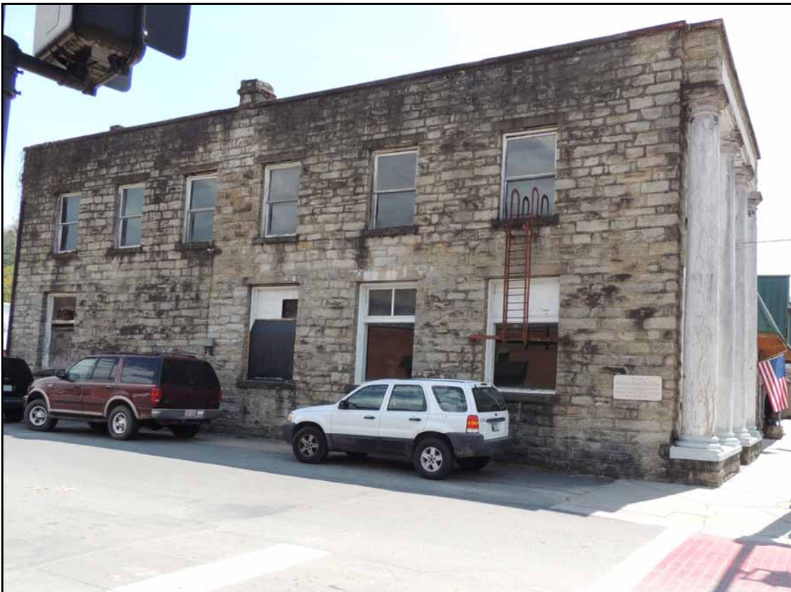
The side of the building, which does not get direct sunlight has a lot of mold and grime. It is interesting that the mold and grime is more towards the upper area of the building.